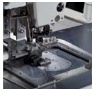
FZ 反轉壓腳 Inverted Clamp