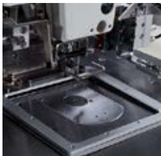
SS 側移壓腳 Side shift clamp