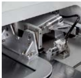
MY 帽沿 Cap brim