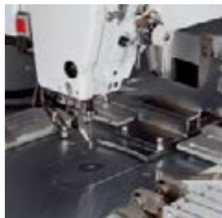
HM 快速換模 Template fast changing