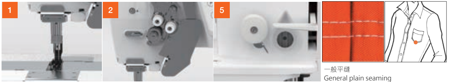
一般平縫 General plain seaming

Direct-Drive Servo Motor: 750W high-power motor provides strong penetration for effortless sewing of medium-to-heavy materials.