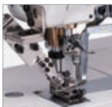
上切 Top Cutter.

針織布薄料至厚料皆可良好應對，無須調整且線跡美觀。 Suitable for fine to heavy knit fabrics, good stitches without further adjustment.