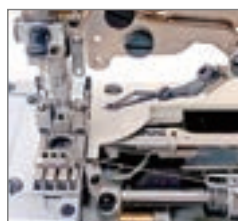
電動夾線 Electric Thread Gripping.