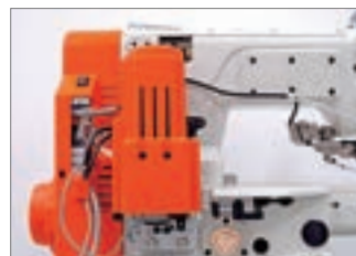
伺服電機驅動 反應速度快 停針更精準 Driven by servo motor with quick response and precise needle stop position.